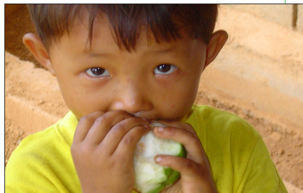
A Lao boy who could potentially be given the Children's Bible Coloring Book.

Please pray as I try to devise a way of getting this book into the Lao market... I am hoping to distribute Bible stories to parts of society that have not yet heard anything about God. I am hoping just to plant seeds with this action so that others may water and reap a harvest.